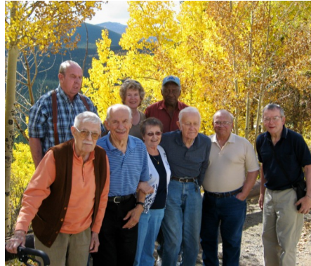
Golden Gate State Park