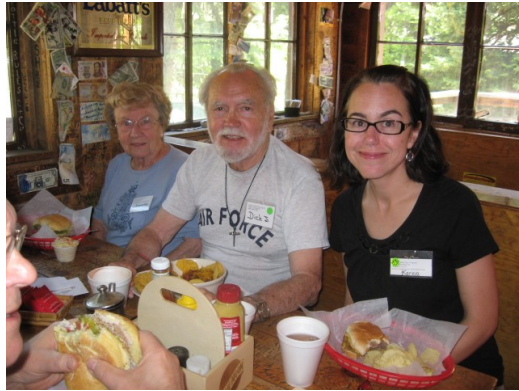
Lunch at a restaurant is included!