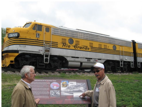
Learning about trains with new friends