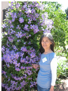
Outings at Gardens

Times may vary due to different activities