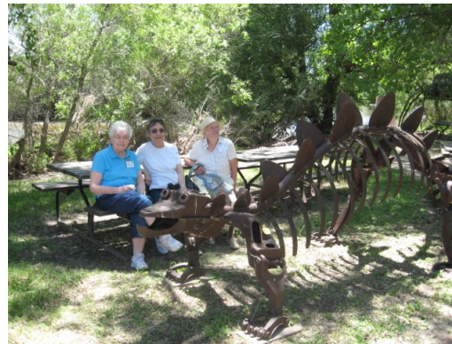
Swetsville Zoo, Fort Collins