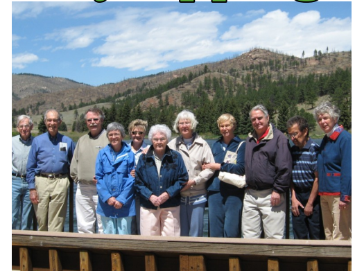
Pine Valley Ranch Park