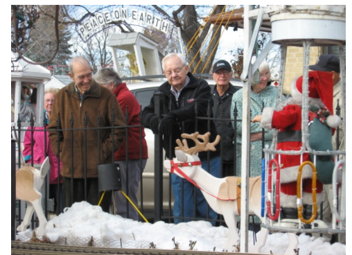
Holiday Daytripping—bundle up!